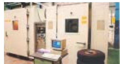
Judge double ageing chamber referring DIN and ISO standard for big rubber products like lorry tires.